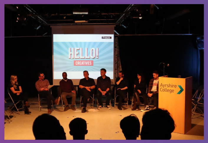
Hello Creatives Launch Networking event

"We are delighted that Ayrshire College has been awarded the Enterprising FE College of the Year award. We're particularly proud to see a number of our students recognised by Bridge 2 Business for their enterprising efforts and we hope that those students who have set up a new business with support from the Enterprising Students Fund have continued success in the future."